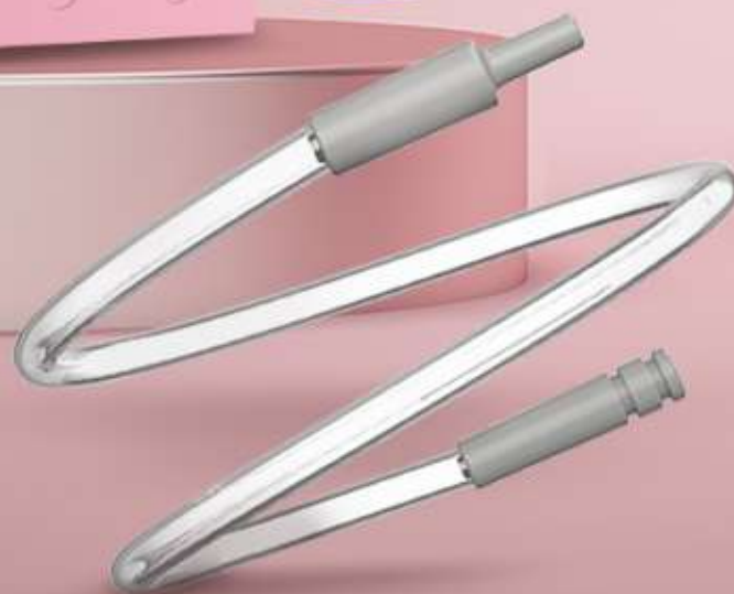
• air tube