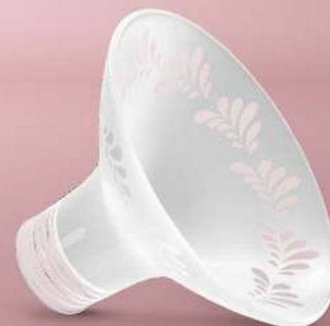
• breast shield 24 mm