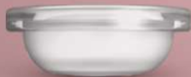
• 2x membrane