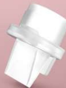
• 2x valve